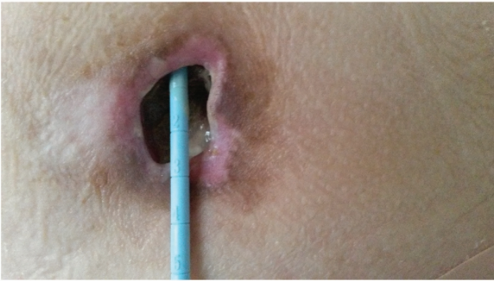
Above picture taken 17/12/15, right hip