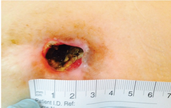
Above picture taken 27/02/16